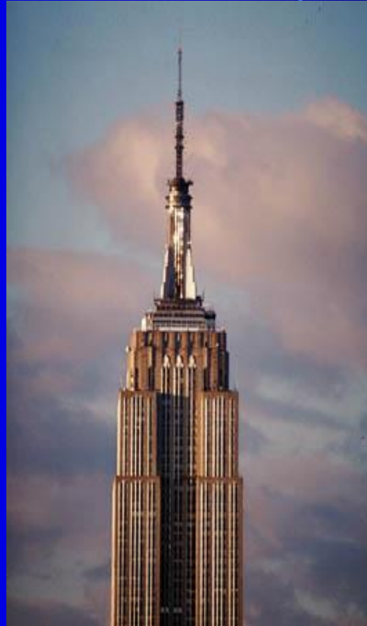
Universal Alibi Center